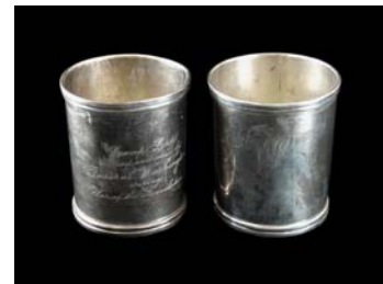
Silver camp cups used by General Washington during the War of Independence. Collection of The American Revolution Center.